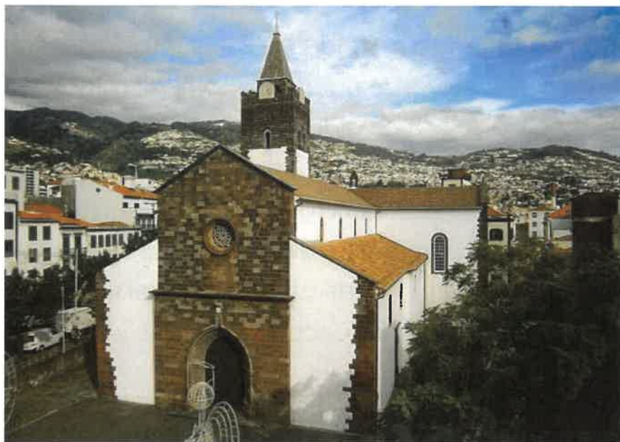
Our Lady of the Assumption Cathedral of Funchal

The Madeira Archipelago was officially discovered by the Portuguese between 1418 and 1419 and comprises the islands of Madeira, Porto Santo, Desertas and Selvagens. Its capital is Funchal, and the current population is approximately 260,000. The Diocese of Funchal was created on June 12, 1514, with St. James the Less and Our Lady of the Mount as its patron saints, and its cathedral is the Cathedral of Funchal. The Diocese has 96 parishes and seven deaneries – Funchal, Câmara de Lobos, São Vicente/Porto Moniz, Calheta, Machico/Santa Cruz, Santana and Ribeira Brava/Ponta do Sol. D. Nuno Brás da Silva Martins has been the Bishop of Funchal since 2019, making him the 33rd bishop of the Diocese.