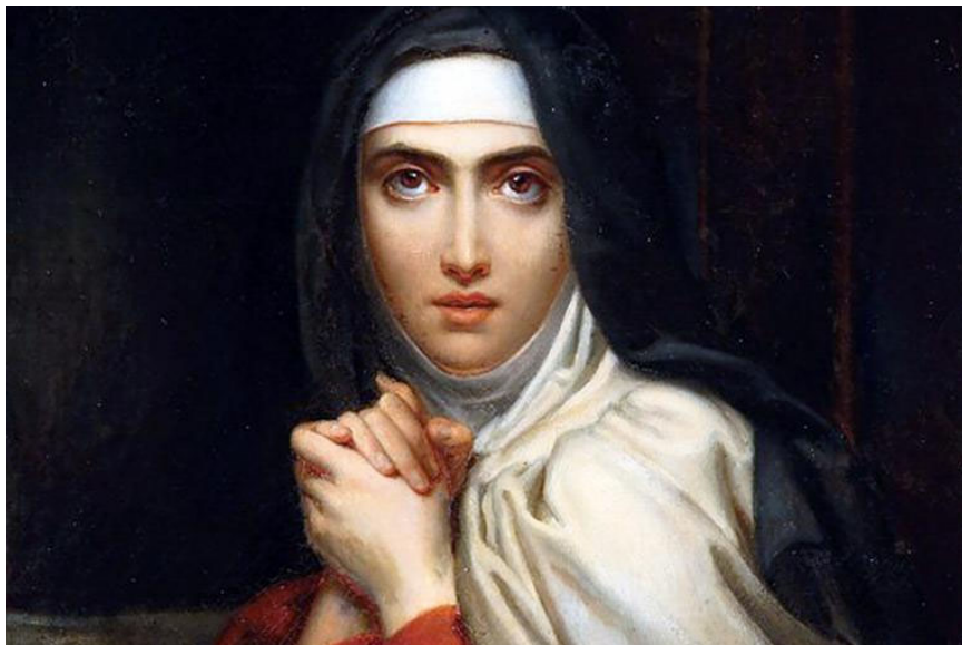
St. Teresa of Avila