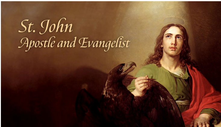
Feast Day: December 27

The Feast of St. John the Apostle and Evangelist, celebrated on December 27, honors the beloved disciple of Jesus—one of the Twelve Apostles and the author traditionally associated with the Gospel of John, three epistles, and the Book of Revelation. St. John holds a unique place in salvation history as the disciple “whom Jesus loved,” present at key moments of Christ’s life, including the Transfiguration, the Last Supper, and the Crucifixion. At the foot of the Cross, Jesus entrusted Mary to John, symbolizing John’s role as a spiritual son of the Mother of God and, by extension, a spiritual father to the Church.